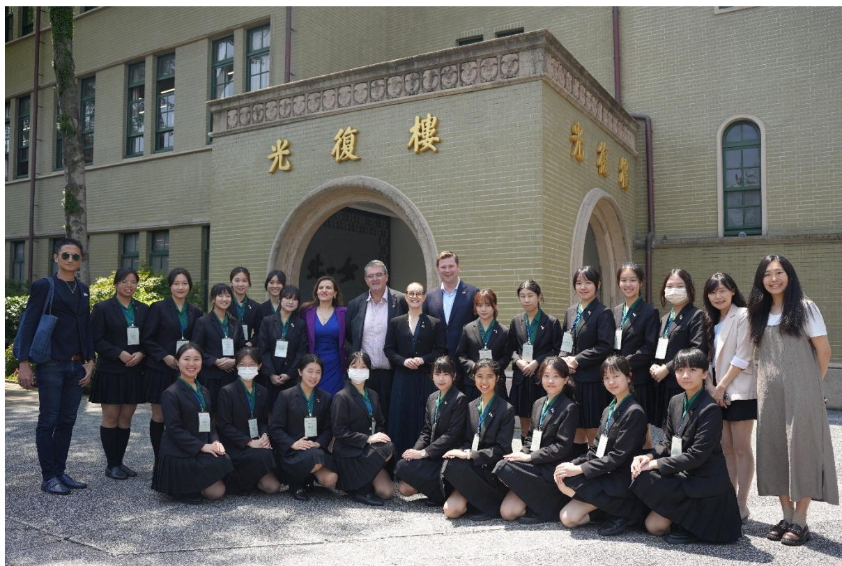
▲ 澳洲新南威爾斯州議會代表團 x 北一女中師生大合照