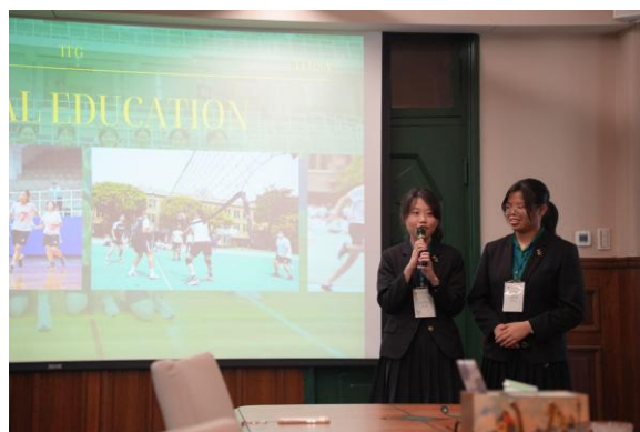
▲ 綠衣使節簡報部 簡報介紹